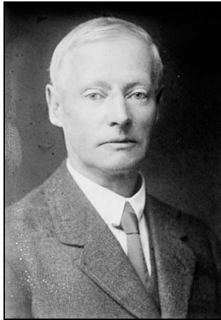
W.W. Jacobs (1863-1943)