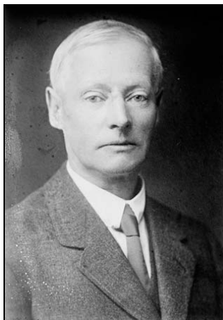
W. W. Jacobs (1863-1943)