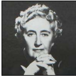
Agatha Christie (1890-1976)